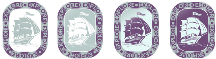
IMAGE INVERSION AND 3D MOVING ICONS

M 2 combines programmable movement with colourful iconography to deliver a new standard in currency authentication. Based on Nanotech's KolourOptik ® nanographic display technology, these features capture and hold the user's attention as they intuitively maneuver and tilt the banknote to confirm its authenticity. M 2 is exceptionally thin and suitable to multiple application processes and substrates.